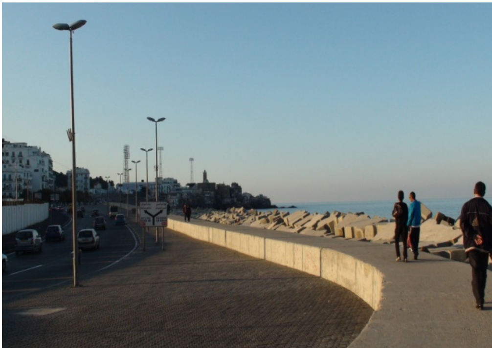
Figure 7. People walking along the path next the sea wall (2 – 3 m), eastern Algiers, road in the direction of Bologhine district.