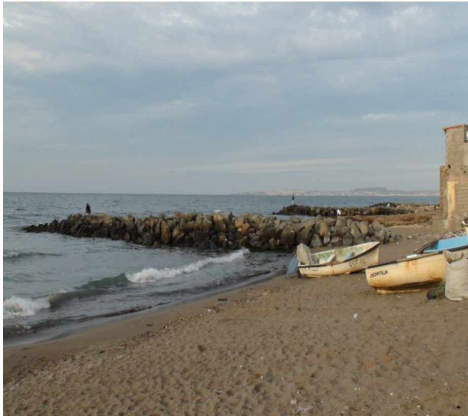
Figure 3: Fishing boats of a vulnerable group.

These elements are very important in deciding where to place educational warning signs along coastal areas. The impact of tsunami waves traveling at 20 km/h on the boats of local fishermen is not the same as the impact of tsunami waves traveling at 50 km/h for the same elements (Figure 3).