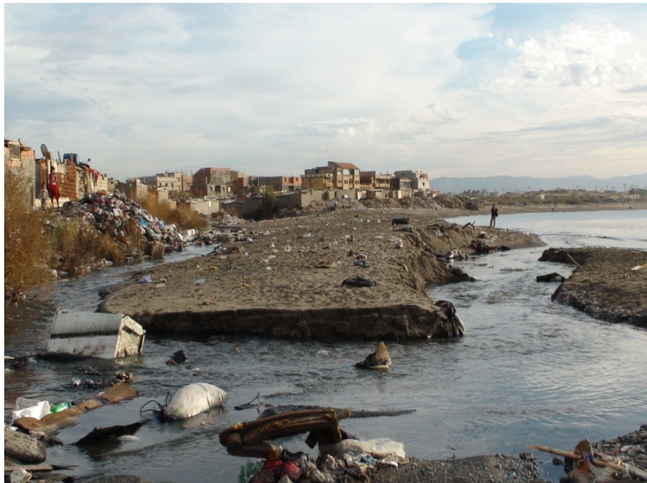
Figure 1. Slum at the entrance of El Oued El Hamiz, Bordj El Bahri, Algiers bay, Algeria.

In view of the above-described vulnerabilities, the purpose of the present study is to develop a risk scale in the framework of a tsunami warning program. Thus, a disaster risk assessment method for Algiers Bay is specifically developed, based on the combined impact of earthquakes and of generated tsunamis that would affect the coast. A first attempt is to determine a vulnerability index, as developed and described in an earlier publication (Amir et al., 2012). Subsequently, additional consideration is given to vulnerability from seismic ground shaking, to the regional geology and to materials used for construction. By combining the tsunami risk to the seismic vulnerability, an attempt is made by this study to identify potentially weak vertical infrastructures and to quantify the population's exposure to the risk. Finally, tsunami parameters are estimated from a tsunami modelling study.