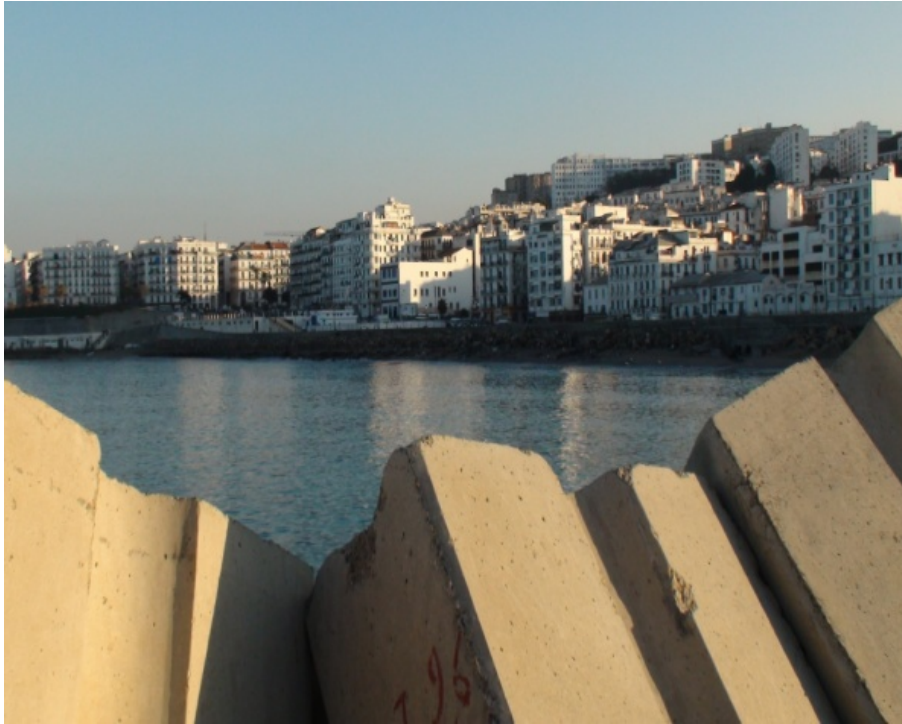
Figure 8. Sea Wall (2 - 3 m) in front of the Popular Beach of Bab el Oued

Most of the structures in the Algiers region date back to periods of colonialism. In the older part of the city (Bologhine, Alger Centre, Bab El Oued, Belouizdad), the walls are already vulnerable because of the degree of degradation. The rehabilitation of older buildings is extremely difficult to attain. According to a 2008 UNEP report: “ The use of specific systems of knowledge and practices developed and accumulated over generations within a particular group and region reflects many experiences and problems solving ”.