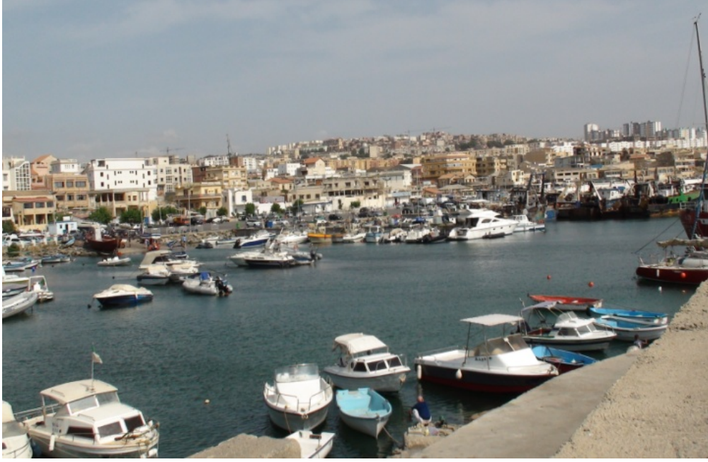
Figure 6. View of the district of Ain Benian (Harbor El Djemila, seawall height = 3m).