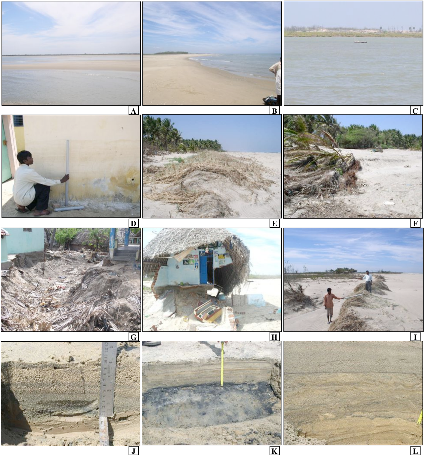
PLATE-I DESTRUCTIONS BY TSUNAMI WAVES: A- SAND BAR DEPOSITION IN VELLAR ESTUARY; B- SAND BAR DEVELOPMENT IN M.G.R. ISLAND; C- AERIAL VIEW AND ERODED SAND DUNE IN M.G.R.ISLAND; D- WATER RUN-UP HEIGHT (1.2m) IN MUZHUKKUTHURAI; E- STABLE DUNE WITH VEGETATION, PARTIALLY BREACHED; F- ERODED DUNE AND UPROOTED TREES; G- 4' EROSION IN THE SETTLEMENT AREA IN M.G.R.ISLAND; H-HANGING HOUSE AFTER EROSION; I- STABLE CONTINUOUS DUNE WITH VEGETATION, BUT PARTIALLY BREACHED; J- LAYERED SEDIMENTS OVER ESTUARINE CLAY BY TSUNAMI; K- LAYERED SEDIEMENTATION OVER CARBONISED CLAY; L- TRAMPLED STRUCTURE OF TSUNAMI SEDIMENTS OVER MASSIVE DEPOSITS.