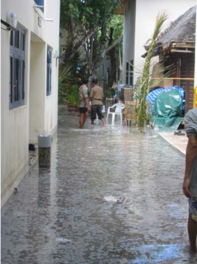
Figure 15. An employee on Cocoa Island took this photograph during the tsunami. It shows that tsunami flooding inundated buildings, and damaged the interior furnishings but did little harm to the building structures. Note that more than one flood line was left on the walls of the building at left.

Figure 14. The hollow blocks used for construction in Guraidhoo are about 12 cm wide. This photograph above shows the construction blocks at right and a newly repaired building at left. The small building has new construction on the right side where the wall was lost during the tsunami, but the remainder of the structure pre-dates the tsunami. The roof is corrugated metal. The buildings are being constructed in the pre-tsunami manner and still lack reinforcing and foundations.