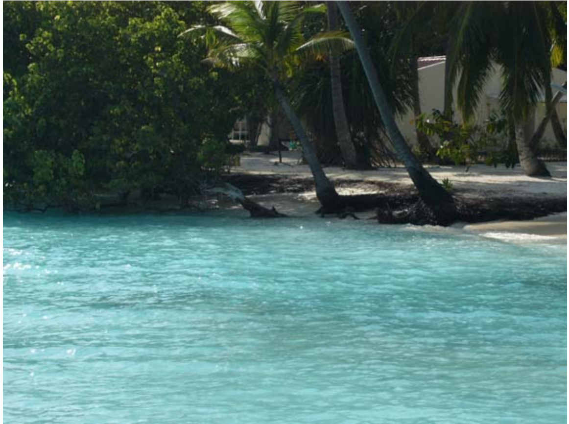
Figure 2. Photograph of Villivaru. These resort room units were flooded due to their proximity to the coast and the fact that this is a very low-lying islands (roughly 0.5 m above sea level).