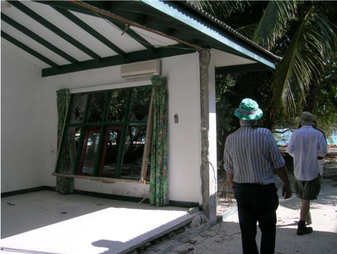
Figure 5. The interior of this resort room unit on Kandooma was destroyed by the tsunami. The building lost the sidewall; and the window units were forced in by the force of the tsunami. The air conditioning units above the windows, and the lighting and electrical fixtures were filled with seawater. The contents of the room were spread over the island. The exterior doors (front and back) on many units were torn away or damaged.

On Biyadoo Island, the sand walkways between buildings had been lined with narrow concrete blocks and concrete block walls. The concrete block edging along the paths restricted the flood inundation. These low obstacles to the tsunami flooding restricted the water damage to the outer margins of the island, seemingly preventing damage to the vegetation and buildings in the interior of the islands.