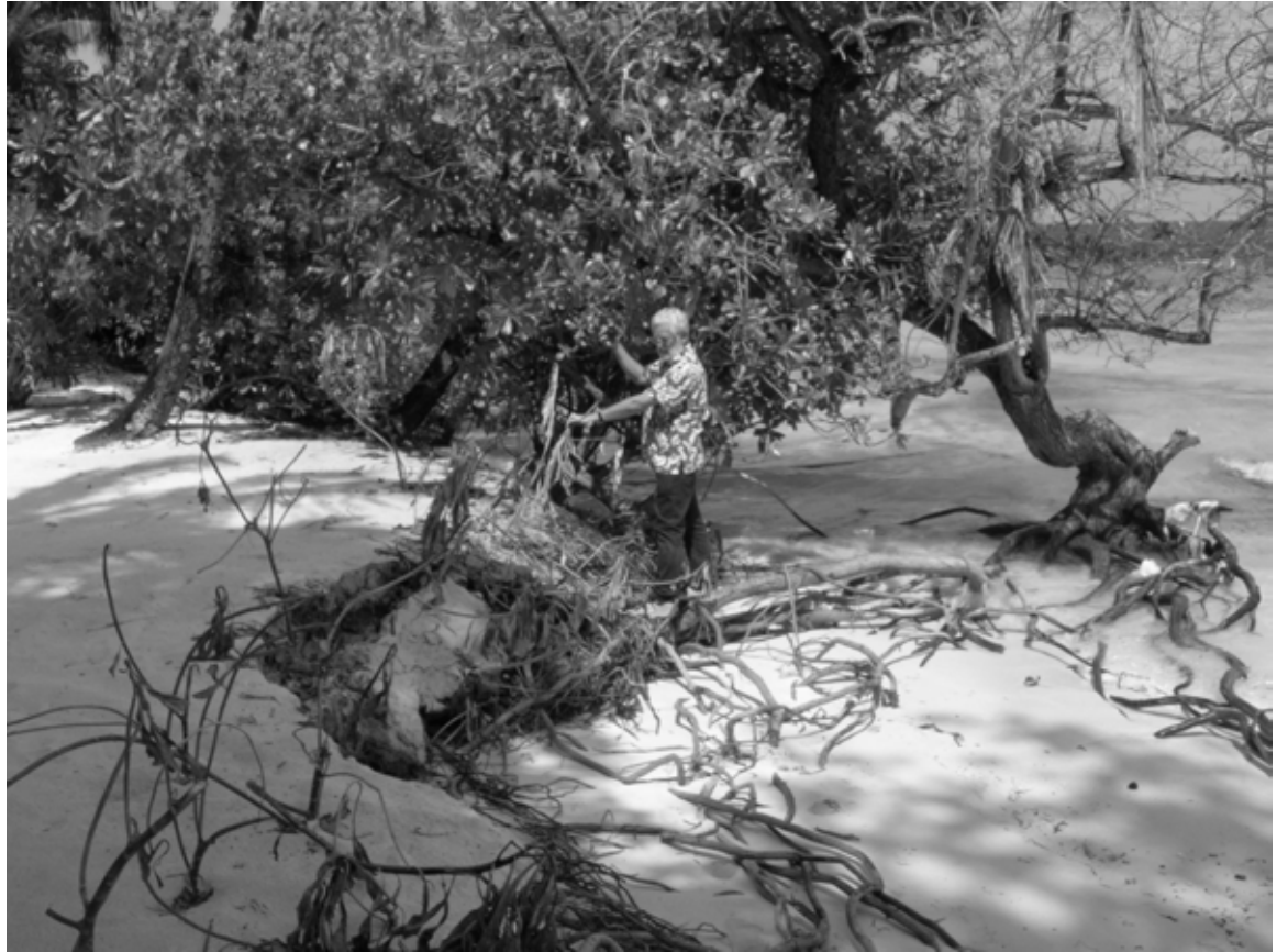
Figure 9. The most obvious tsunami damage was to the vegetation. This photograph demonstrates the extent of erosion and under-mining of the vegetation. The tree in the photograph is now standing in the sea. The roots of the trees are now exposed above sea level. Many trees were killed, undermined, damaged by salt, and their leaves stripped.

On Guraidhoo Island we were informed that some of the erosional scarps existed prior to the tsunami. And, on Biyadhoo Island we saw a similar scarp formed between our first survey at low tide and our second survey at high tide. Clearly, normal current induced erosion events can produce scarps just like those reported by local residents as being due to a tsunami origin and observations even a month after the event cannot distinguish between the two origins. Photographs taken of the islands prior to the tsunami indicate that many of the erosions scarps were present prior to the tsunami and thus seasonal erosional processes must have formed some of them.