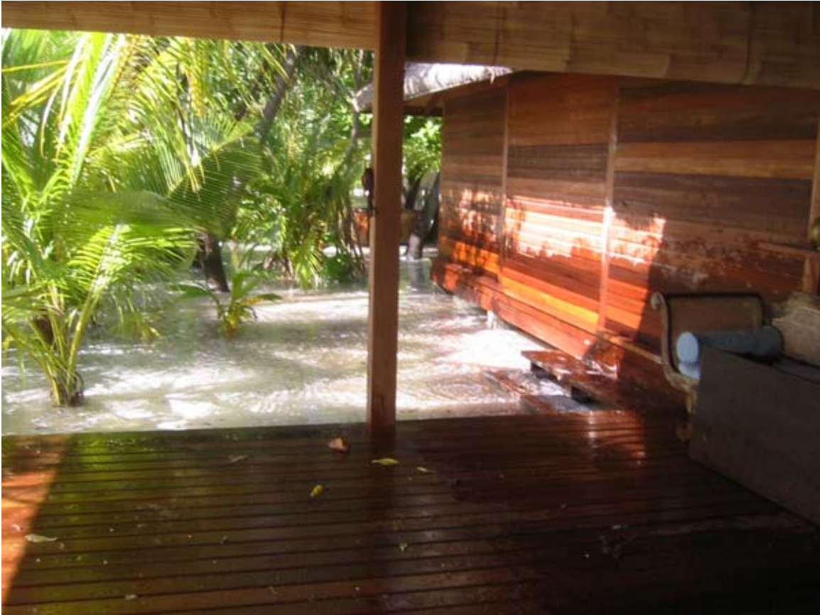
Figure 12. Employees of the Cocoa Island Resort, in the Maldives Islands, took this photograph of the tsunami flooding. The tsunami flooding at the time of this photograph is roughly 20 cm deep. The seawater is laden with sand, resulting in a milky appearance. The wall at right has been wet by the tsunami inundation. The splashy or turbulent nature of the inundation is evident from the uneven splash lines on the wall. The splash is roughly 1 m above the island surface. The buildings on the island were inundated by water. The flooding damaged computer equipment, bedding, and furnishing but very little structural damage occurred.