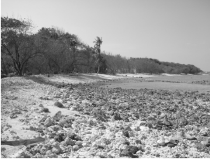
Figure 4. The manager of the resort reported that 15 m of sand (horizontally) was stripped from this beach. A beach ridge or berm can be seen at the back of the beach, where the vegetation is seen.