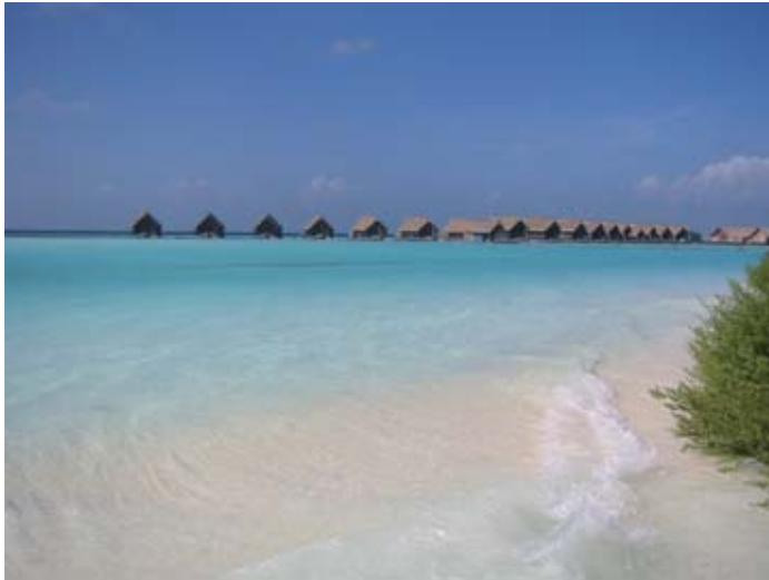
Figure 19. These are the bungalows built on concrete poles within the Cocoa Island resort lagoon. The walkways and the bungalows survived with very little damage. Fortunately the tsunami only reached the base boards of the bungalows, leaving the structures intact.

The bungalow support-poles were supported on concrete bases about 18 inches 0.4 m in diameter in the lagoon bottom (Figure 19). The manager said he would suggest that the designers double that dimension when they add a new phase of bungalows in the future. [Several engineering teams have visited the resort since the tsunami.]