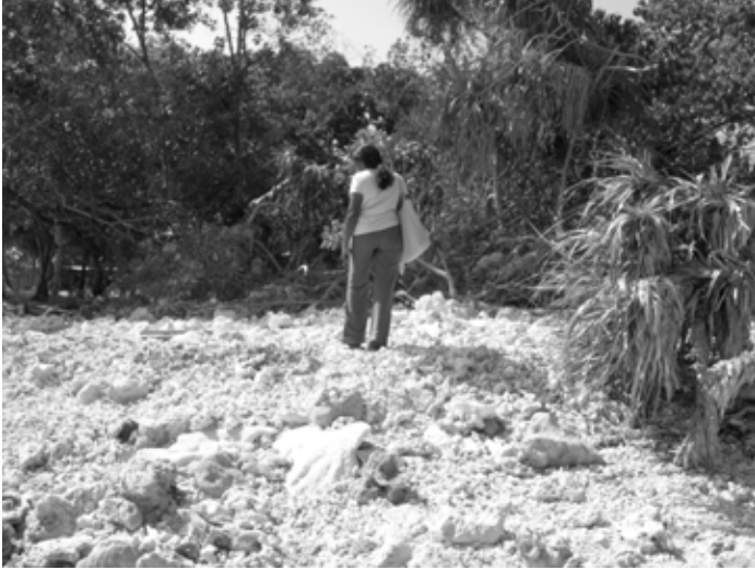
Figure 6. On the eastern side of the Kandooma Island, coral clasts were carried up onto the island surface in one area, by the tsunami. The typical coral clast size was roughly 10 cm across. The clasts bury the base of the trees along the coast up to roughly 20 cm.

A row of palm trees planted on a reclaimed beach on the lagoon side was heavily damaged and many were lost. Along this part of the island, in places, the beach sand was completely washed away. The leeward beaches experienced severe erosion, retreating as much as 5 m (Figure 6). The resort jet-ski was washed into the channel and observed traveling at full speed, and rider-less after the tsunami. Two hours later, the jet-ski was seen again in the channel, going the opposite direction (toward the lagoon). Two days later, the jet-ski was found on the next island (Guraidhoo).