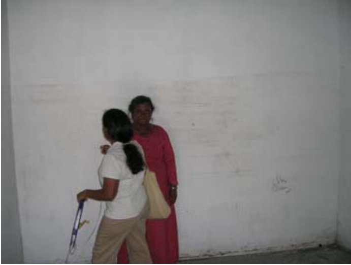
Figure 11. Residents of the Guraidhoo Island assisted us during our surveys and allowed us to enter their homes and measure the flood lines left on the interior walls. The flood lines can be seen on this wall, as dark horizontal lines on the white paint. The tsunami flooding exceeded the height of most residents.