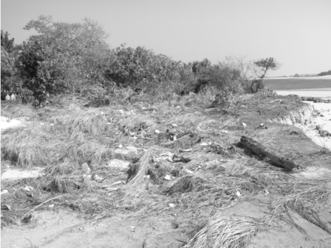
Figure 3. Photograph of the vegetation that was laid back onto Guraidhoo Island by the tsunami inundation. This shoreline is situated between Guraidhoo and Lhosfusfi Islands. A log (at right) and corals (5-8 cm across) have been thrown up on the island surface.

Within the back-beach area, the bark on some tree trunks had been partially removed by abrasion. On the eastern (barrier reef) sides of the islands, the shrubs were stripped of leaves. Further inland, fine sand covered leaves remaining on plants. Occasionally we observed small areas in the lee of trees that had been shielded from damage, leaving a small patch of green grass in the lee of a tree trunk (a few 10's of cms in area). Generally, the grass was buried by a thin layer of sand with strands of seaweed mixed in. The grass was brown from salt damage. The broad ranging roots of coconut trees were exposed in erosional scarps at the back of many beaches. Up to one half of the root mat of the trees could be exposed to the air, without apparent damage to the living palm tree.