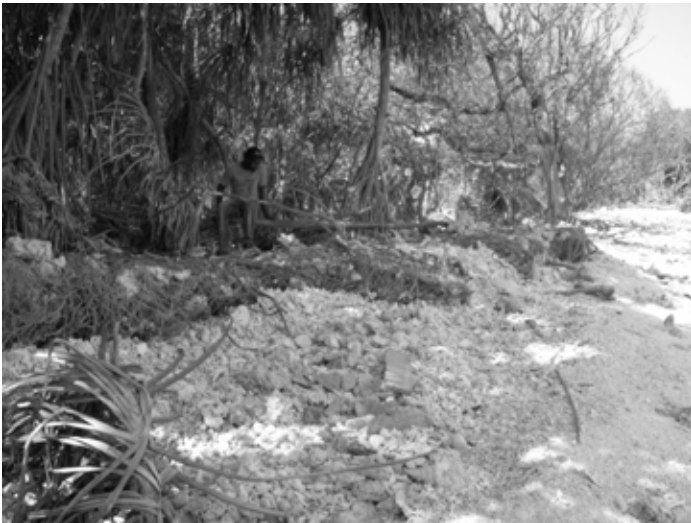
Figure 5. On the eastern side of Kandooma Island, coral clasts were left along the back of the beach by the tsunami. The maximum coral clast size is roughly 10 cm across. The clasts bury the roots of some trees along the coast. These trees are roughly 5 m inland from the ocean.