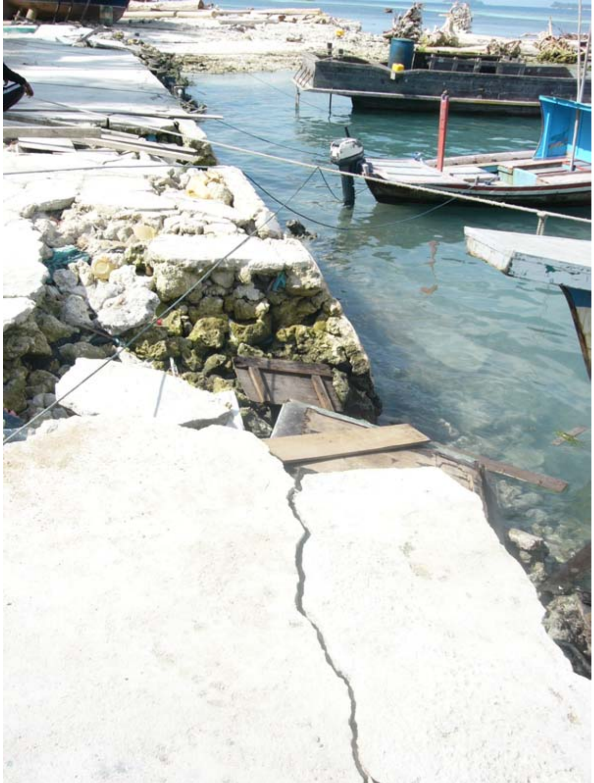
Figure 6. It was common to see piers like this one damaged or toppled by the drawdown. The waters draining from the islands eroded behind the piers and the concrete structures were heavily damaged or destroyed. This photograph shows the damaged pier at Maafushi.