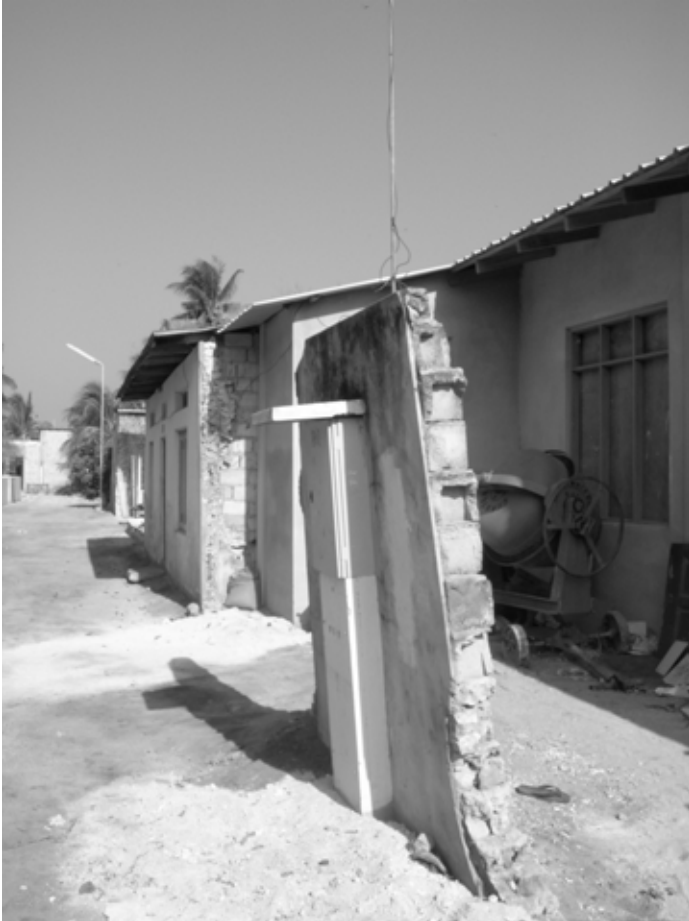
Figure 10. This wall is what remains of a building damaged by the tsunami on Guraidhoo Island. It shows the typical construction of blocks without reinforcing rods, and without interior fillings of concrete.

house is now situated on the outer row of structures left standing on the eastern side of the island, it used to be part of an inner row of structures.