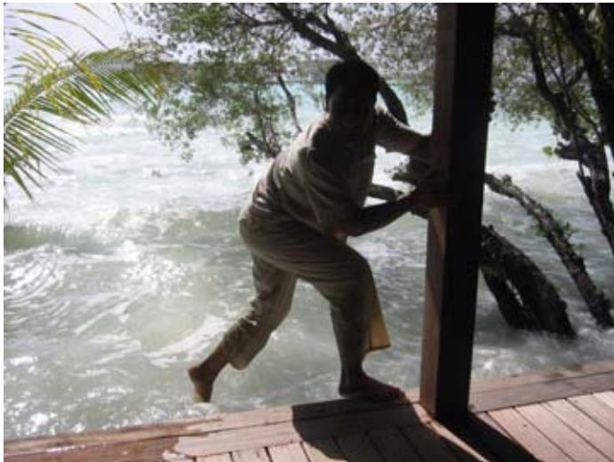
Figure 16. In another photograph taken by a resort employee, a person can be jumping out of the tsunami flood waters on to a porch of one of the Cocoa Island Resort buildings during the tsunami. In the background the bungalows lining the lagoon can be seen in the distance. During the tsunami, the water rose to the floor of the bungalows without damaging the building structures significantly or the raised walkways. The bungalows were designed to sit above sea level.

Approximately 1600 ft or 500-600 m of sand cay was removed from the north side of the island (Figure 16). The sand that was removed was washed away into the deep water. The employees reported that the sand cay (or sandbar) that extends either north (or south) of the island changes seasonally. Throughout the years, it is present on the north side one season and then is eroded and accumulates again on the south side and continues to shift (north then south) on a yearly basis.