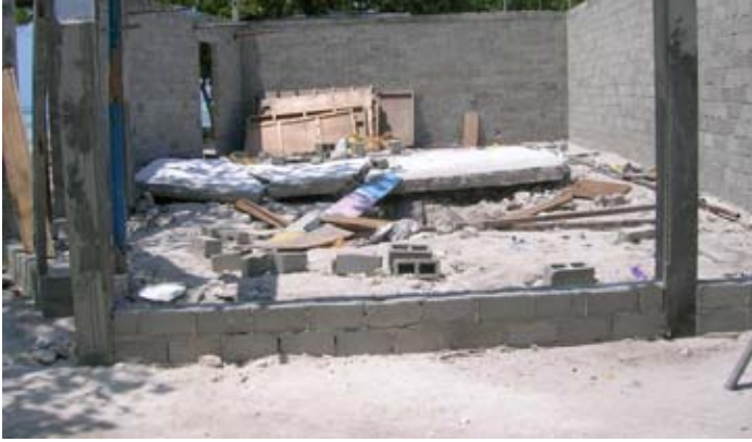
Figure 13. At the center of this picture is a toppled hollow block wall. Reconstruction of new walls appears to enclose the old wall.

The young man took the small boy he rescued to the health center when the waters drained to about 1 ft deep. But, no one there could revive the boy. Each time the young man closed his eyes and pressed his fingers over his eyes to cover them, you could see him reliving his experience.