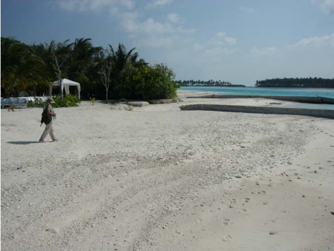
Figure 10. The reclaimed beach on the east side of Kandooma Island was heavily eroded, with incised gullies (shown at center of the photograph) removing a meter of sediments. The erosion undermined the two concrete jetties so that the inland portions of the structures are entirely missing. A plastic lawn chair was wedged underneath the closer jetty. A great deal of beach and lawn furniture was permanently lost during the tsunami.