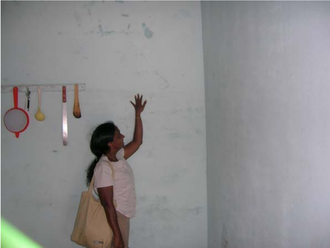
Figure 11. This photograph illustrates the flood lines preserved on the interior walls of a partially destroyed residence on Maafushi. The waters flooded this home to roughly 1.5 m. The occupants were forced to swim in order to survive the tsunami.

While we were conducting leveling surveys to determine the elevation of tsunami flooding, members of the communities often came up to us and related their experiences. Clearly the residents were traumatically affected by their experiences. They volunteered their observations and when their comments were unclear only limited questioning asked for clarifications. During these conversations, notes were taken (Appendix 1) and occasionally pictures were taken. But we did not try to take formal interviews for we decided that it was unnecessary to have the residents relive the trauma of the tsunami unless they chose to do so by volunteering to talk with us.