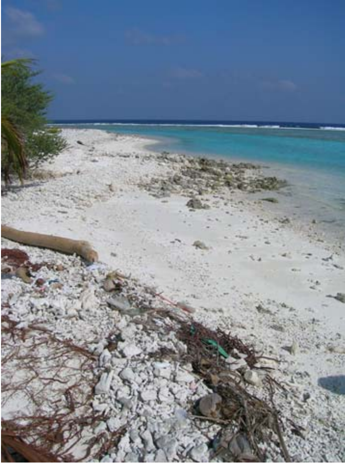
Figure 7. The leeward side of the Kandooma resort island experienced significant erosion. The roots of coconut trees are exposed to the air. A comparison of satellite pictures taken before and after the tsunami shows that a large number of coconut trees were missing after the tsunami and 5-15 m of beach sand had been removed.

Scuba divers on resort excursions, diving in the water at 16 ft depth, were pushed down to 30 ft. both on the lagoon side and in the seaward side of the resort island. The clarity of the seawater increased after the tsunami. The particulate matter in the water column seemed to be gone.