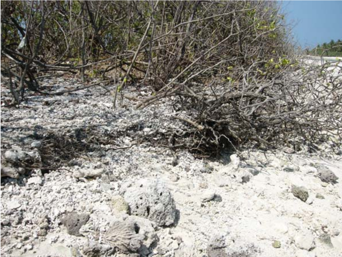
Figure 13. The thick vegetation along the shore at Lhosfushi Islet trapped much of the coral at the back of the beach and in around brush. Much of the brush on the island was killed by salt water or torn away by the tsunami. The shallows bank east of the island was stripped of coral and sand, and exposed well-cemented beach rock in the surf.

to the buildings, and limited the damage by tsunami impact (Figure 13). Where vegetation was missing the tsunami flood inundated the buildings, breaking down concrete block walls, breaking in windows, tearing off front and back doors, etcetera as well as flooding the buildings.