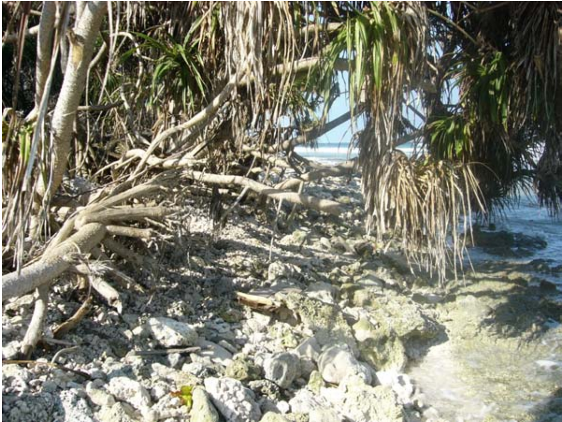
Figure 4. This tree is the Pandanus tree. Because the tree proves a broad cross-section to the sea, it stopped corals from being transported onto the surface of the island. These trees were buried in several cms of coral clasts.

Additionally, in the Maldive Islands, a bushy coastal shrub, 1 to 2 m high, provided excellent protection for the islands. Where present, the vegetation caught coral fragments, sand, and debris and provided substantial protection against the forces of flowing water.