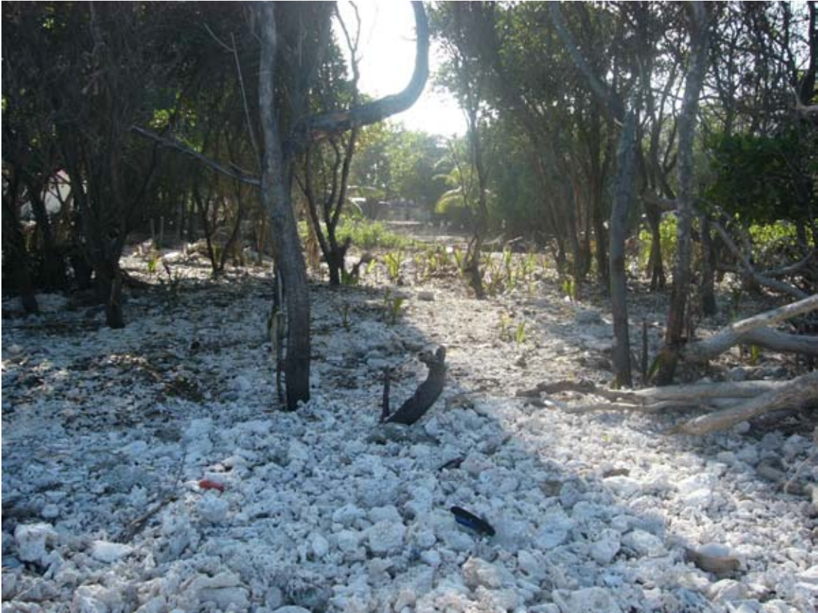
Figure 8. On the east side of Kandooma Island, coral clasts were washed over a berm and onto the surface of the island. The trees are buried in corals about 20 cm in depth. The coral rubble extends about 20 m inland from the sea. Broken trees can be seen to the right.