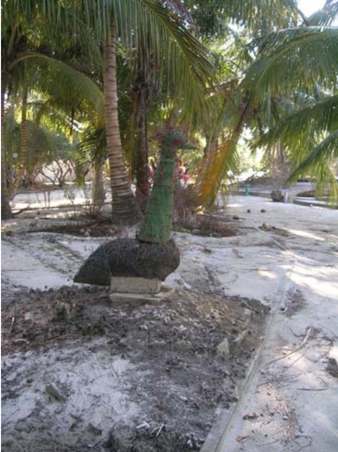
Figure 8. The island of Kandooma was completely flooded by the tsunami. The tsunami arrived from the east and wrapped around the island and flooded inland from the west, meeting near the center of the island. The resort manager reported that he broke out a window in order to escape from the flooding in the employees housing on the east side of the island, where the waters were neck-deep. The entire surface of the island was covered by sand, forming a sheet. In many places the sand sheet does not completely bury the grass. The tsunami flooding abraded paint from the concrete walkways and buildings and the salt water killed the vegetation in the foreground. This topiary form (shape of a peacock) was part of a luxuriant garden that was completely stripped of vegetation.

The interior of power plant had water in it 36 in. or 0.9 m deep that knocked out the generators. The tsunami flood moved the large air/noise suppressor units still in shipping crates inside the power plant walls (Figure 8). Four days were spent before the power plant became operational.