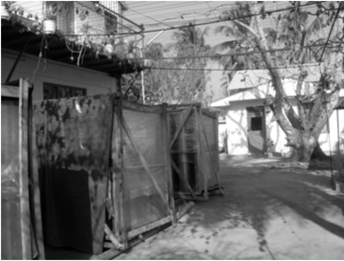
Figure 9. These wooden crates of equipment for the Guraidhoo Island Power Plant had been delivered and placed in side the concrete garden wall surrounding the power plant. The tsunami flood picked up and moved the heavy equipment and crates inside the 1.5 m high concrete block garden walls.

Damage to buildings was heavy. There were many masonry walls that were left leaning throughout the island. The rows of houses of masonry block closest to the eastern coast were destroyed and most of the houses in the second row away from the sea were destroyed or highly damaged (Figure 9). Many building with the older construction style of cemented corals and limestone blocks cemented together (with lime mortar) were heavily damaged or destroyed. Everyone left their homes and followed one another to the care home (which became the triage center). Two children died and two were lost.