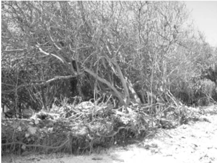
Figure 3. The vegetation on the east side of Kandooma was crushed by the tsunami and laid backyards toward the center of the island. The leaves were stripped from the trees. The roots of the vegetation were undermined and the coral from the littoral zone was trapped within the vegetation. But, the vegetation provided important protection to the buildings nearby.

Outdoors, the ground was cluttered with white coral everywhere. Even the dark corals carried up onto the beaches turned white the next day. On the east side of the island, vegetation had been overturned (Figure 3) despite having roots of several meters wide and the shrubs and trees were rolled backward onto the island. A beach berm (or ridge, Figure 4) of as much as 3.28 ft or 1 m high was present on the east side of the island (Figure 5), with broken corals and whole coral heads mantling the berm. Sand was in large part absent from eastern side of Kandooma Resort Island, having been redistributed over the island and into the lagoon. Coral clasts (blocks) were strewn inland on east side (Figure 6) inland of the storm berm, in a very spotty fashion.