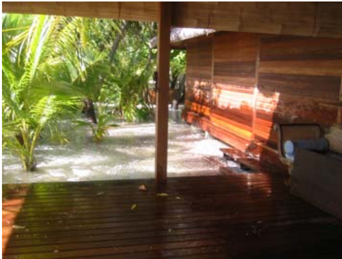
Figure 18. This picture was taken during the 2004 Tsunami on Cocoa Island. The tsunami flooded the island as can be seen in this picture (provided by a resort employee). The water was milky in color due to the suspended sand in the water. No flood line was preserved on the building's exterior wall. The waters rose over a meter above the ground but the flood was turbulent enough that the trace left by the water appears irregular. Episodic draining of tsunami flood waters from the islands left the flood lines, according to the survivors.

The manager spoke with us about the resort facilities. The resort has a long boardwalk (or pier) raised above the lagoon, which leads to offshore wooden bungalows. The bungalows survived the tsunami very well with minimal damage. The bungalows sit above the lagoon on stilts 10 ft or 3 m above the lagoon floor. The lower half of the support poles (5 ft.) is covered by lagoon water; the upper half of each support is exposed above the water level. On one bungalow the bottom decorative trim was washed and broken off by the tsunami (Figure 18.) But, the manager explained that there was a great deal of erosion in the lagoon below the walkway and bungalows. One support [out of hundreds] had shifted on the corner of one bungalow.