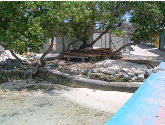
Figure 12. Guraidhoo islanders set up a tent city on one end of the island and have remained there during the reconstruction and our survey (six weeks after the tsunami). The large blue garden wall (at the lower right in this picture) was undermined by the tsunami flood and toppled.