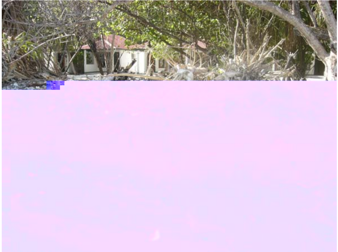
Figure 7. The vegetation was heavily damaged by the tsunami. At right a shrub has been toppled and laid back onto the surface of the island. The thick root mat of the trees has been undermined by sand erosion and blocks of coral were caught in the vegetation. In the background is one of the room units on Kandooma Island, where doors and windows were removed by the tsunami flooding.

On Guraidhoo Island, the residents reported that the boat harbor was shallower after the tsunami, than before. The sands and other debris that washed across the island filled in the harbor to some degree. An image from a cellular telephone showed a boat sitting on the harbor floor when waters withdrew during the tsunami.