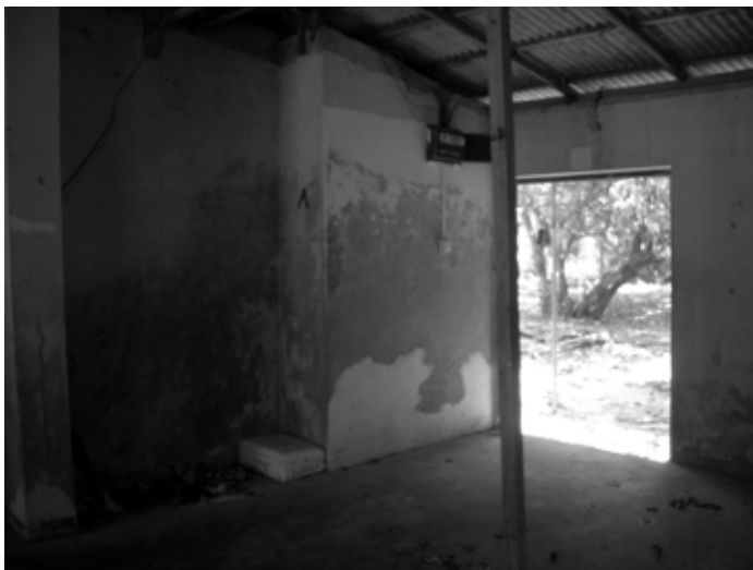
Figure 2. The interior of the employee quarters is shown in this photograph taken after the 2004 tsunami. The building was flooded to about 3 m depth and the

At the time of the tsunami there were 210 guests and 180 employees on the island. The staff is now down to 30. The manager was in his room in the staff quarters (Figure 2) when an employee came to his door and told him to leave. He grabbed his shirt and turned to leave but found he couldn't open the door so he broke the window out and climbed out of the window (cutting his hand in the process). Then the door burst inward from the force of the tsunami waters within the building. The water was up to eye level (about 5 feet, 1.5 m) everywhere on the island for about 5 minutes. He said he would have drowned inside the building if he hadn't gotten out when he did.